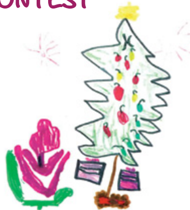
Drawing and title text by Olive, aged 5