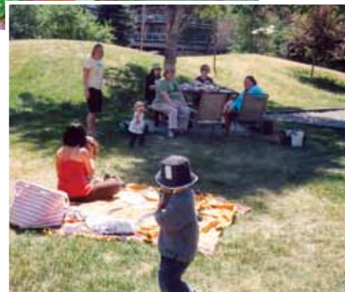
A PICNIC IN WILLIAM ABERHART PARK

defines interesting, uniquely personable neighbourhoods. We are extremely fortunate to have residential streetscapes and lanescapes that are enlivened every summer by the activities of enthusiastic home gardeners. You're all bloomin' wonderful!