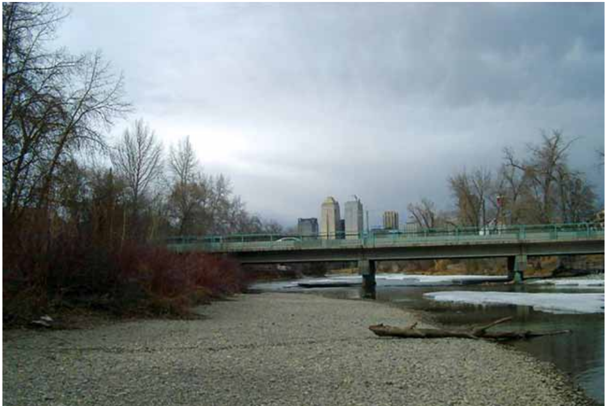
SCOLLEN BRIDGE (FORMERLY #3205)

In the meantime, our idea has taken on a life of its own. The application to name the bridge inspired the City of Calgary's Heritage Planning section to inventory all unnamed bridges in the city with a view to attaching appropriate historic names. ☛