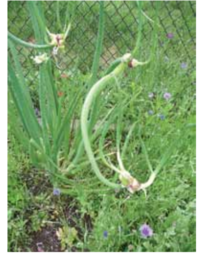
THE EGYPTIAN WALKING ONION PRODUCES LITTLE ONIONS AT THE TOP OF THE STEM, WHERE MOST PLANTS PRODUCE FLOWERS. AS IT MATURES AND WEIGHS MORE, THE STEM FALLS OVER TO THE GROUND, AND IT REPLANTS ITSELF.

I started gardening when I was five. I have friends who started when they were sixty-five. Whatever age or stage you are at, you can meet neighbours, smell the roses and swap stories at your Community Garden. ☛