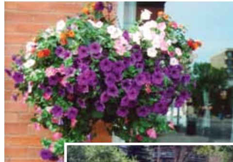
ONE OF THE ABERDEEN BLOCK'S MANY FLOWER BASKETS

Most of the flower baskets along 4th Street are professionally greenhouse grown for weeks in advance of their outdoor debut. The baskets suddenly appear in all their glory, overflowing with extravagantly colourful bloom. As in all things urban, it is diversity which