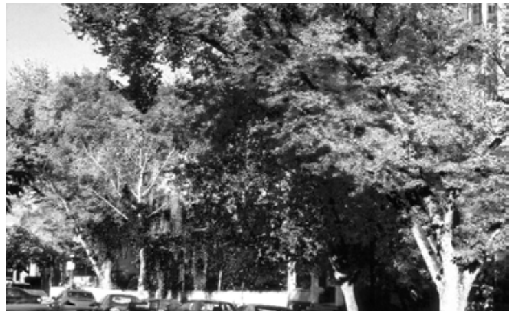
LARGE ELM TREES ARE A BEAUTIFUL AMENITY ALONG THE 24 AVE. PUBLIC BOULEVARD.

Healing gardens associated with hospitals, the horticultural therapy profession, schoolyard naturalization programs, and the increasing interest in community gardening all speak to a renewed desire to benefit from a connection with nature. Apparently, the digital age is not yet long enough to overcome the many thousands of years during which a successful relationship with the natural world determined human survival. The urban forest allows most of us to enjoy a daily connection with nature.