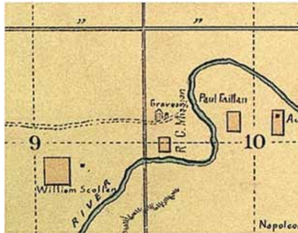
EARLY SETTLEMENT IN CLIFF BUNGALOW-MISSION [LINE BETWEEN SECTIONS 9 AND 10 BECAME BROADWAY (NOW 4TH STREET)]

Odd-numbered sections were normally used for railway land-grants, except 11 and 29 which were reserved for school boards to use, trade for more suitable land, or sell to fund initial school construction. Rail-