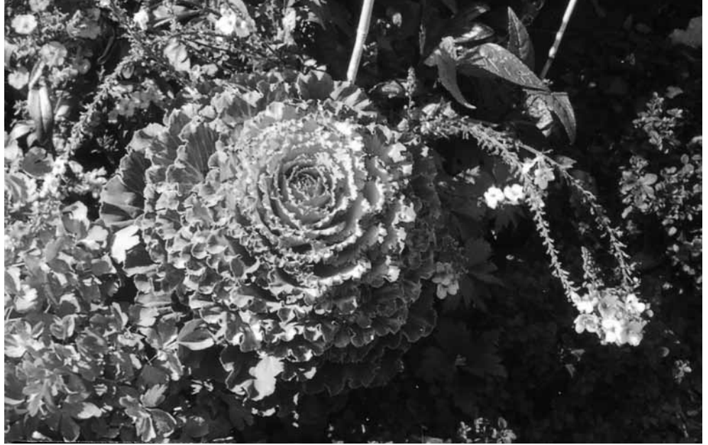
ORNAMENTAL FLOWERING KALE

Last issue's Urban Landscape column mentioned that the commercial streetscape would benefit from extra attention during the winter. It featured a photo of a festive container, one of several which graced Original Joe's patio during winter '08. Consisting